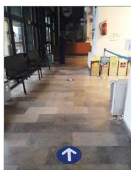
One directional movement in the main hall