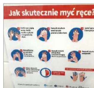
Instruction of hand washing in the bathroom