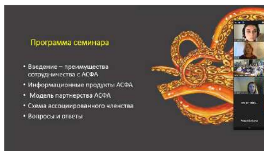
Fig. 1 The introduction slide of the Orientation Session Presentation (M. Kalentsits, FAO ASFA)