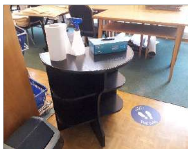
The entrance to the library