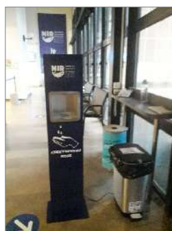
Hand disinfection machine

Below there are pictures illustrating the restrictions in the institute, related to Covid-19: