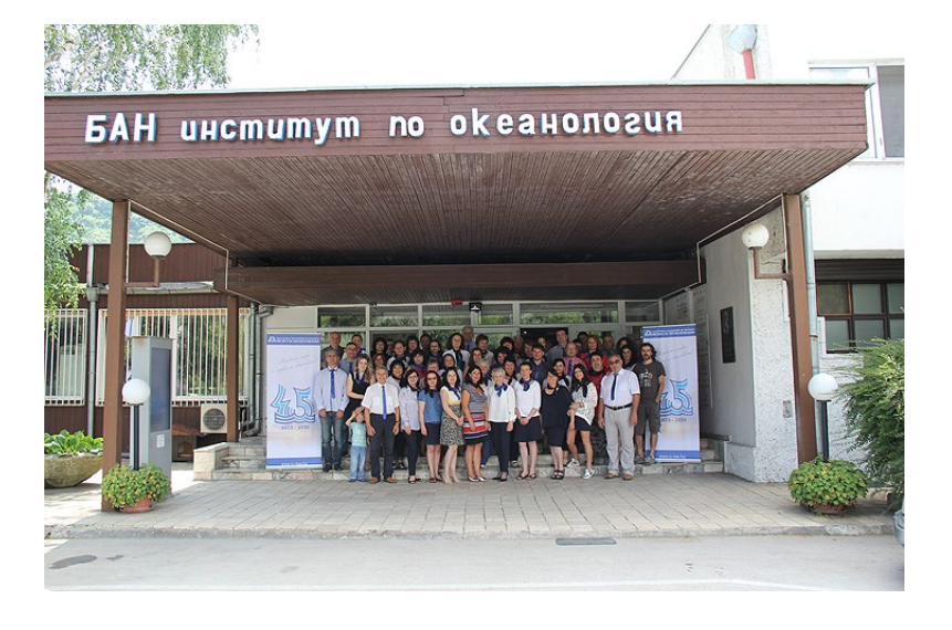
The staff of IO-BAS

At the ceremony, an honorary sign "45 Years IO-BAS" was awarded to staff members (among which also the Head of the Library & Information Services) for their contribution to the Institute's development, as well as to prominent public figures for their support and cooperation in the marine research activities.