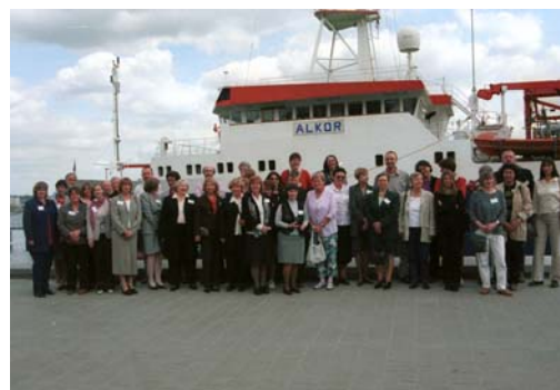
EURASLIC 10, Kiel, Germany

Starting with the 7 th , each EURASLIC conference was organized every two years, and had addressed specific topics which titles are shown in the Table below.